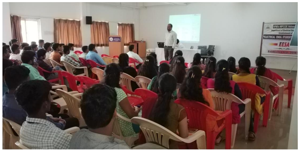
NPTEL awareness lecture on 14<sup>th</sup> January 2019