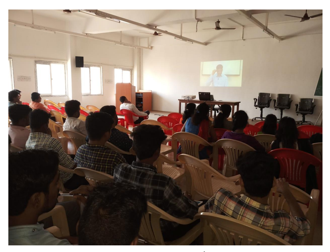
NPTEL local chapter session 1 on 26<sup>th</sup> September 2018